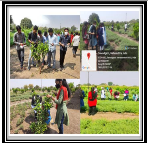
Students Collecting Insects/ Sample