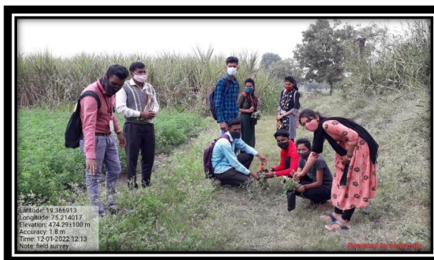
Students collecting plants for preparation of Herbarium