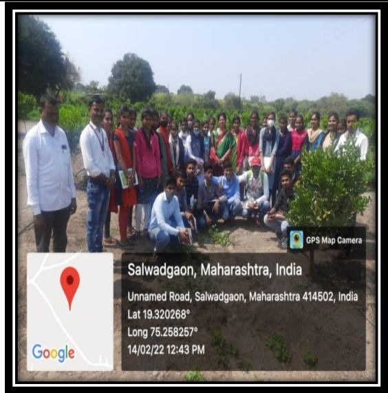
Field Visit to Salwadgaon- Participants