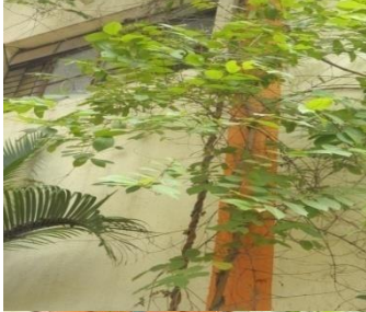
Combratum densiflorum Family –Combratacea Ornamental plant