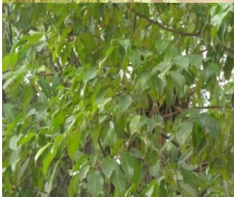
Ficus bejamina Family –Moraceae Uses-Antifungal,antibacterial ,anti-dibatic.