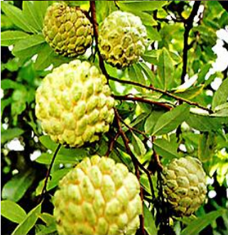
Custard Apple or Seetaphal

Uses – Skin ailments like skin discolouration