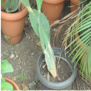
Opuntia hirta Family- Cactaceae Ornamental plant