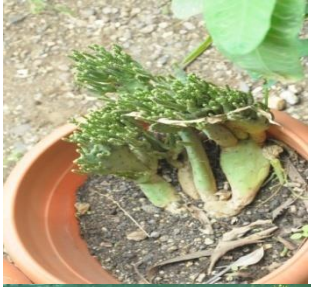
Monadenium ellenbeckii Family- Cactaceae Uses- Treatment of gonorrhoea and healing of sores.