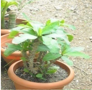
Euphorbia milii Family- Euphorbiaceae Uses- Used to treat bronchitis, asthma related problem problems, colds, flu.