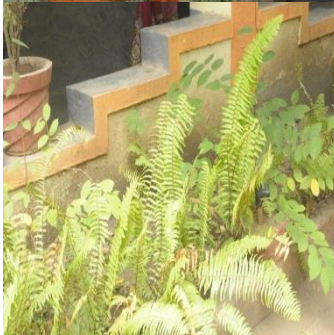
Nephrolepis exaltata Family- Lamariopsidaceae Uses-Ornamental plant.