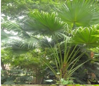
Washingtonia filifera Family –Aracaceae Ornamental plant