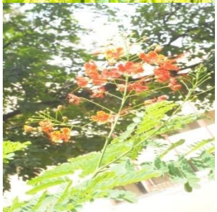
Ceasalpinia pulcherima Linn. Family- Ceasalpiniaceae Uses- Cholera, Menstrual flow, bronchitis, asthma, fever.