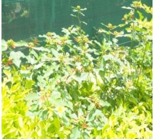
Euphorbia pulcherrima Family- Euphorbiaceae Uses- Pain relief, antibacterial, remedies for skin.