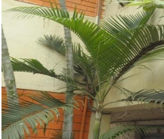
Dypsis lutescens Family- Aracaceae Ornamental plant