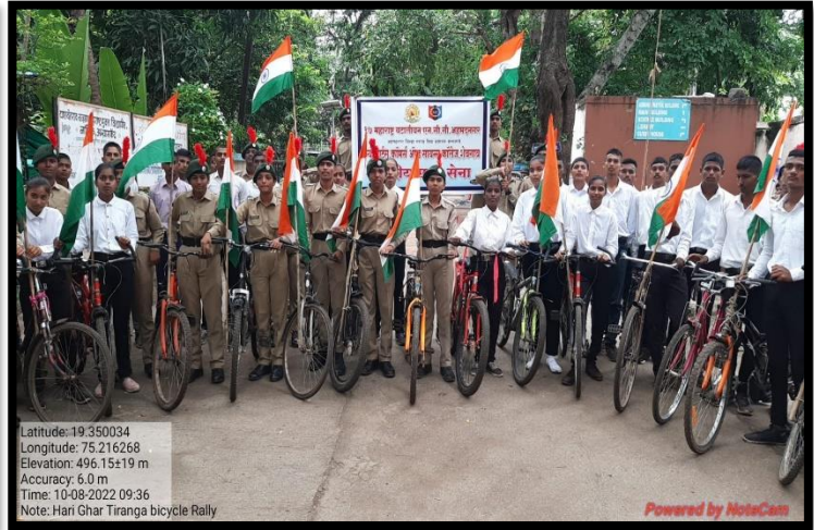
Participation of Cadets in Cycle Rally