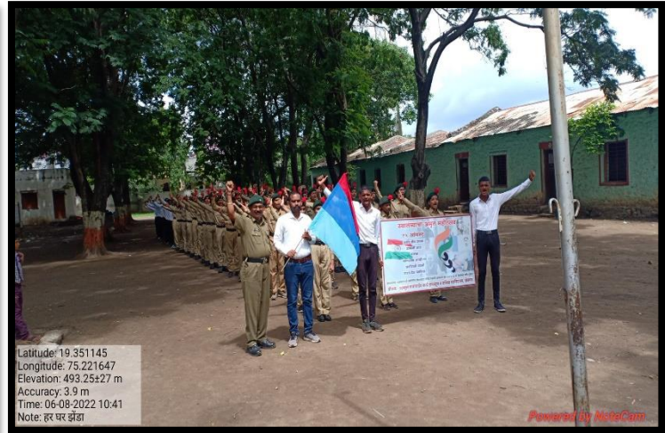
Participation of Cadets in Har Ghar Tiranga Campaign