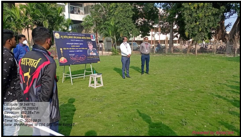
Tribute to CDS Gen. Bipin Rawat by Principal, College Staff & NCC Cadets