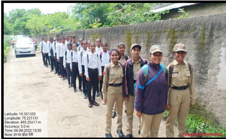
Participation of Cadets in Har Ghar Tiranga Rally