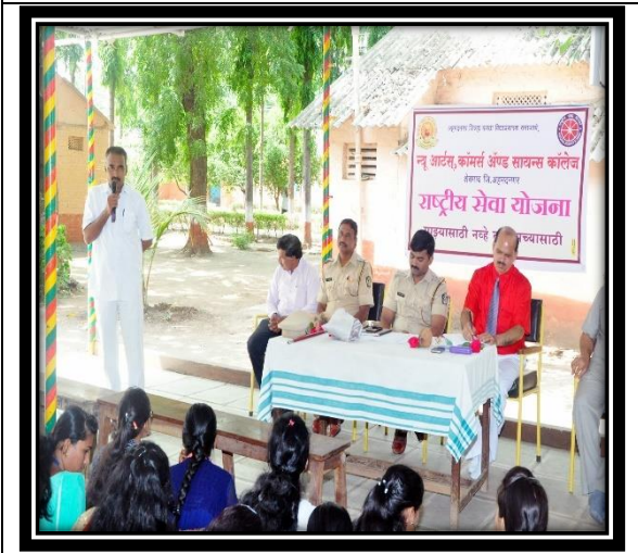
Prisoners express their feelings