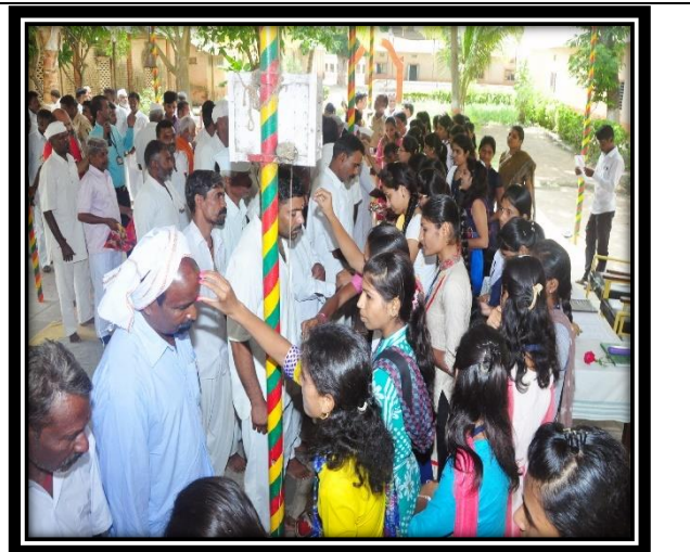
Girl students' tying Rakhi to prisoners.