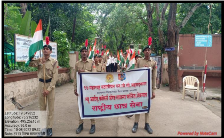
Participation of Cadets in Har Ghar Tiranga Rally