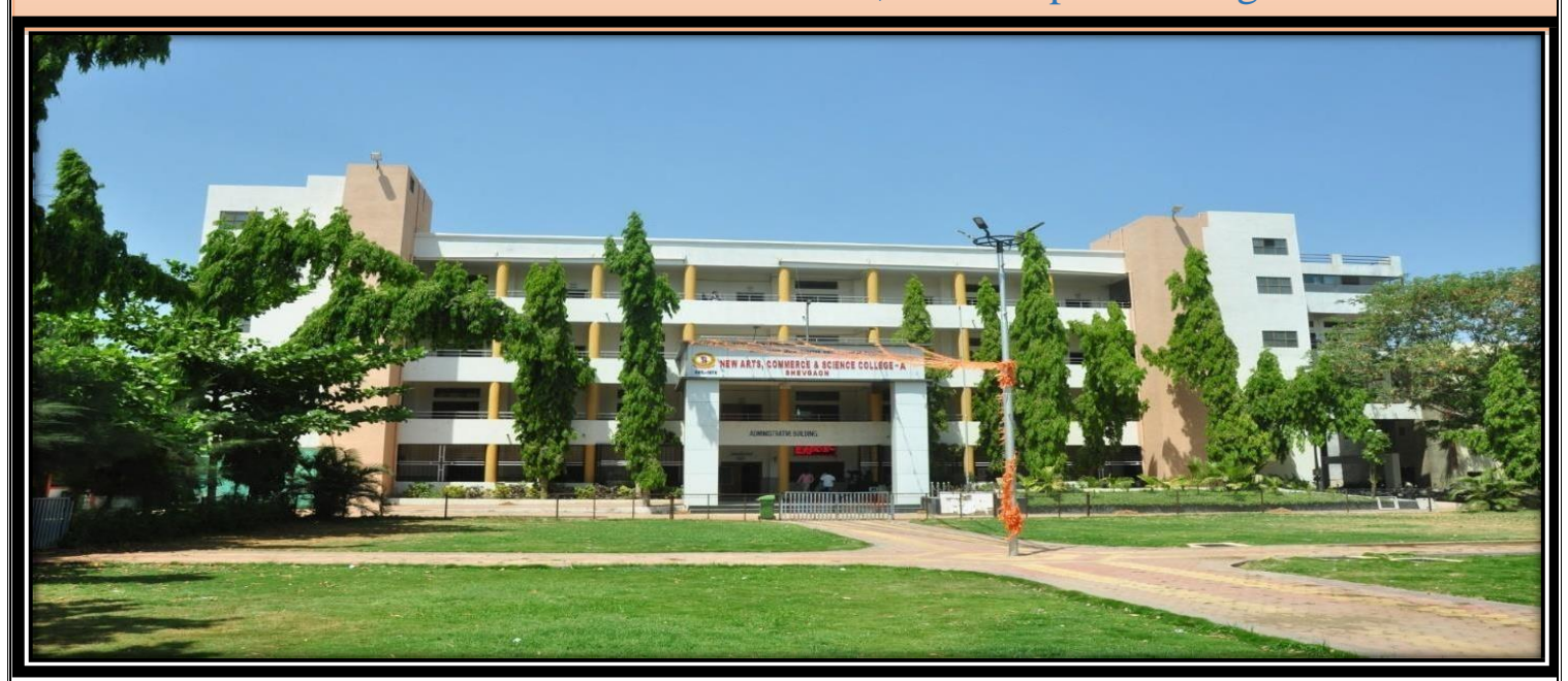
6.1.1: Institutional Practices are in tune with Vision and Mission

CRITERION VI: Governance, Leadership and Management