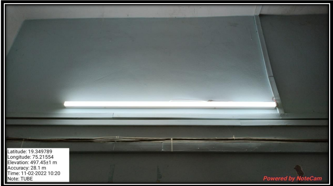
LED tubes in the Administrative Building