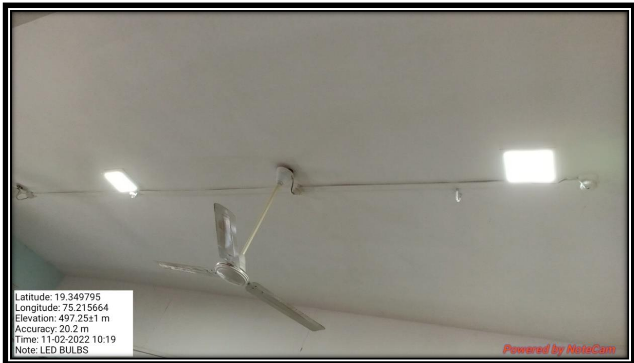
LED bulbs in the Administrative Building