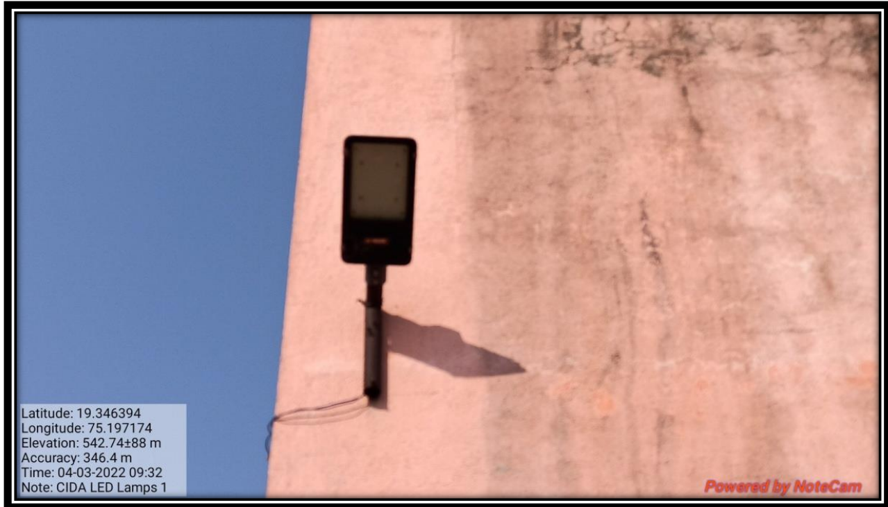
Use of LED Lamps 2 (CIDA)