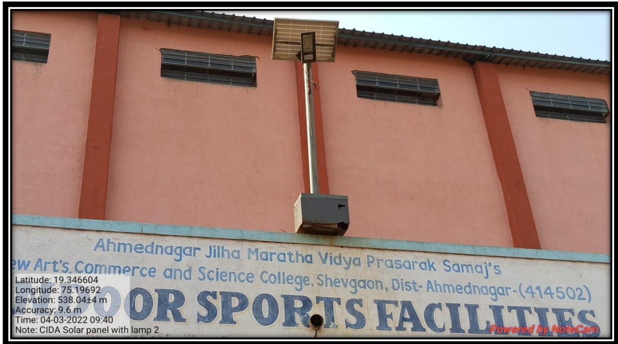
Solar Panel and Lamp 1 (CIDA)