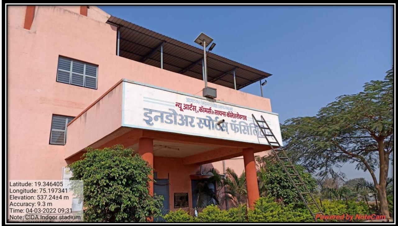
Solar Panel and Lamp 3 (CIDA)