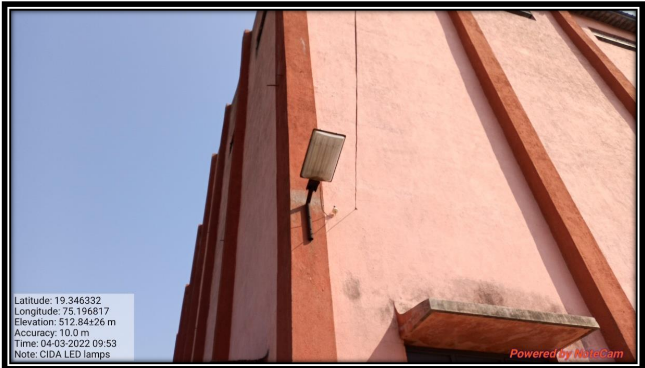
Use of LED Lamps 1 (CIDA)