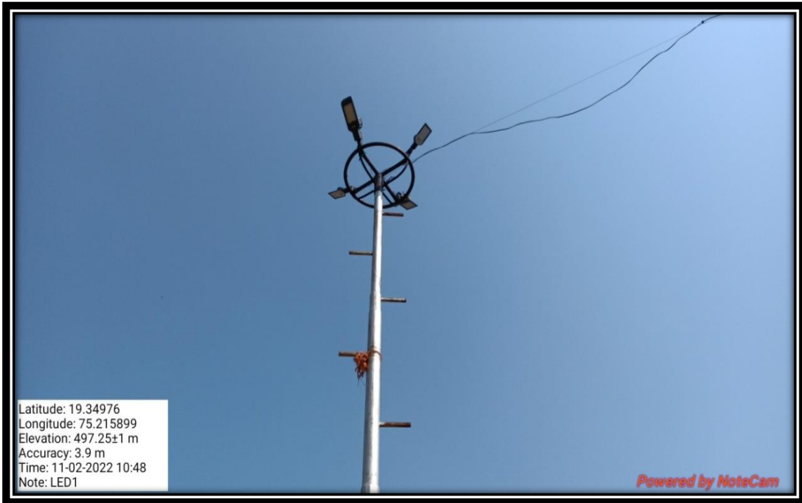
Lamp Post in the Lawn with LED equipment on Solar Energy