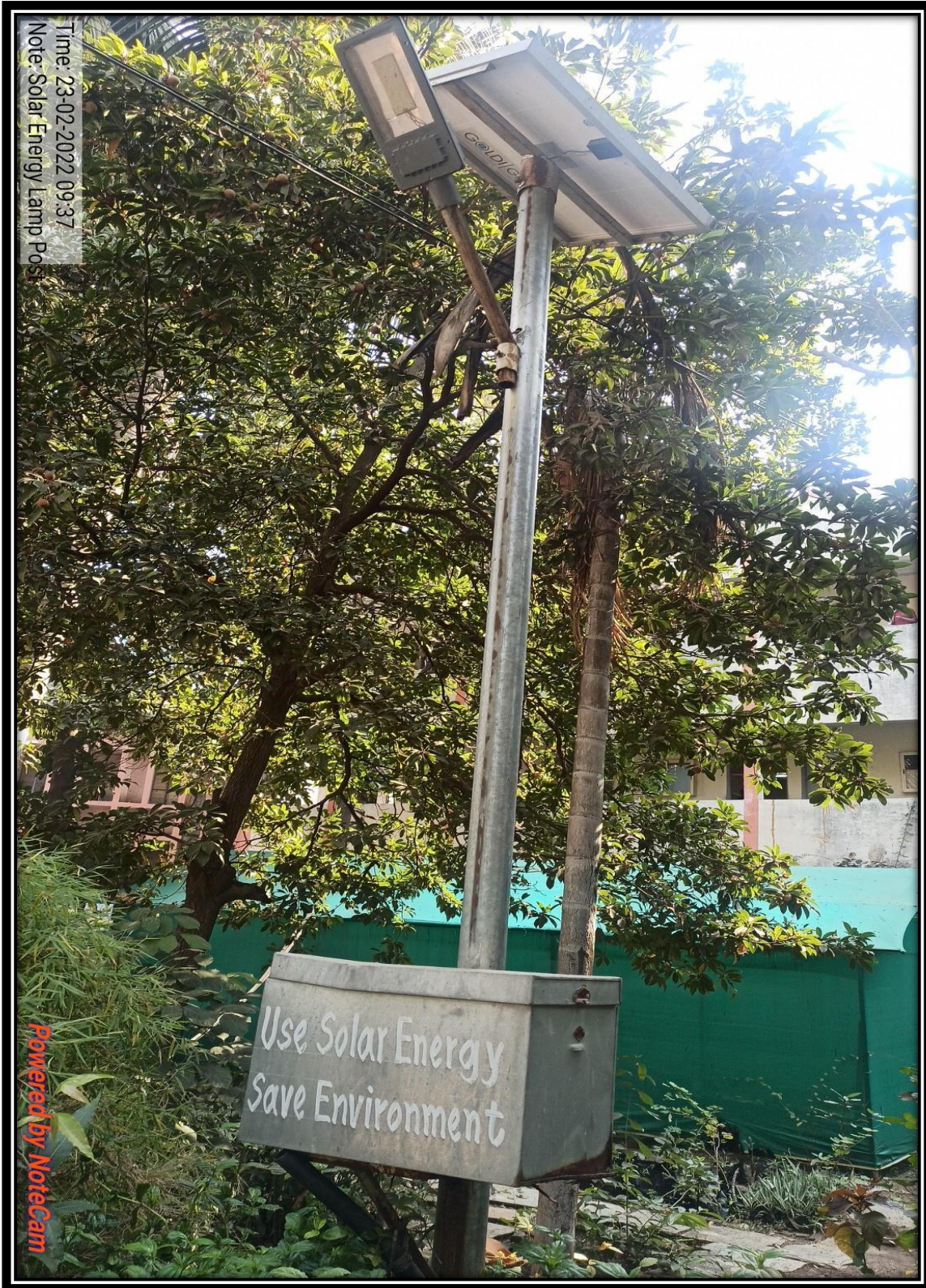
Lamp Post with Solar Equipment and Slogan