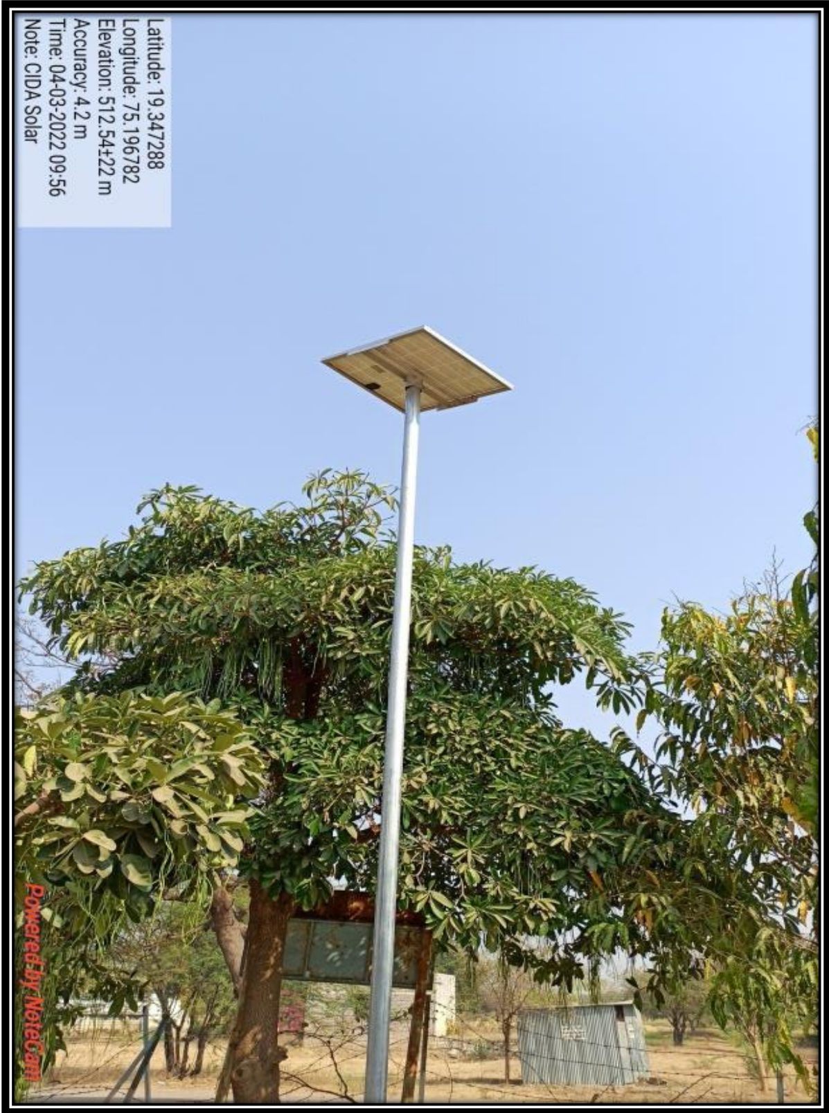
Solar Panel Post on CIDA Ground