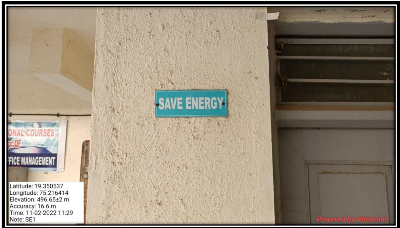
Sign Boards to Motivate Energy Conservation