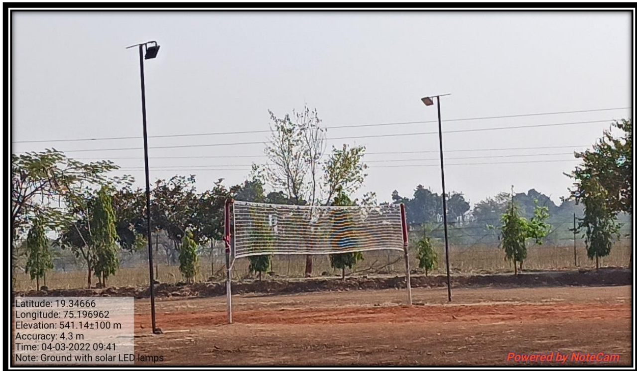
Volleyball Ground with LED Lamps (CIDA)