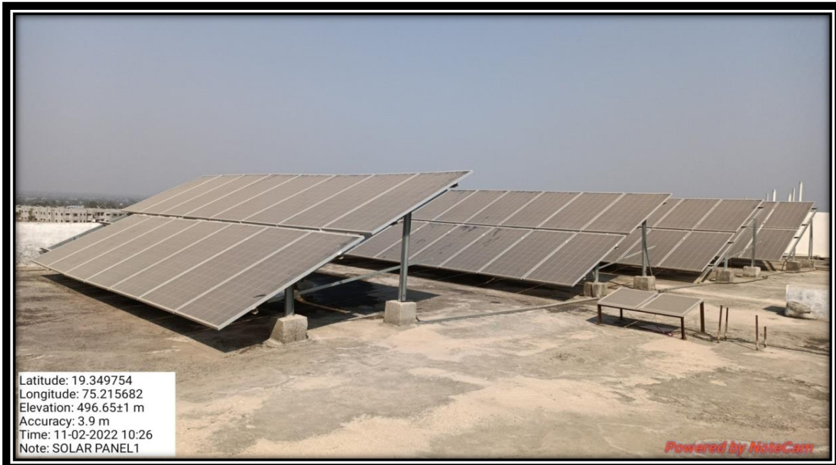
Solar Panels on the Roof