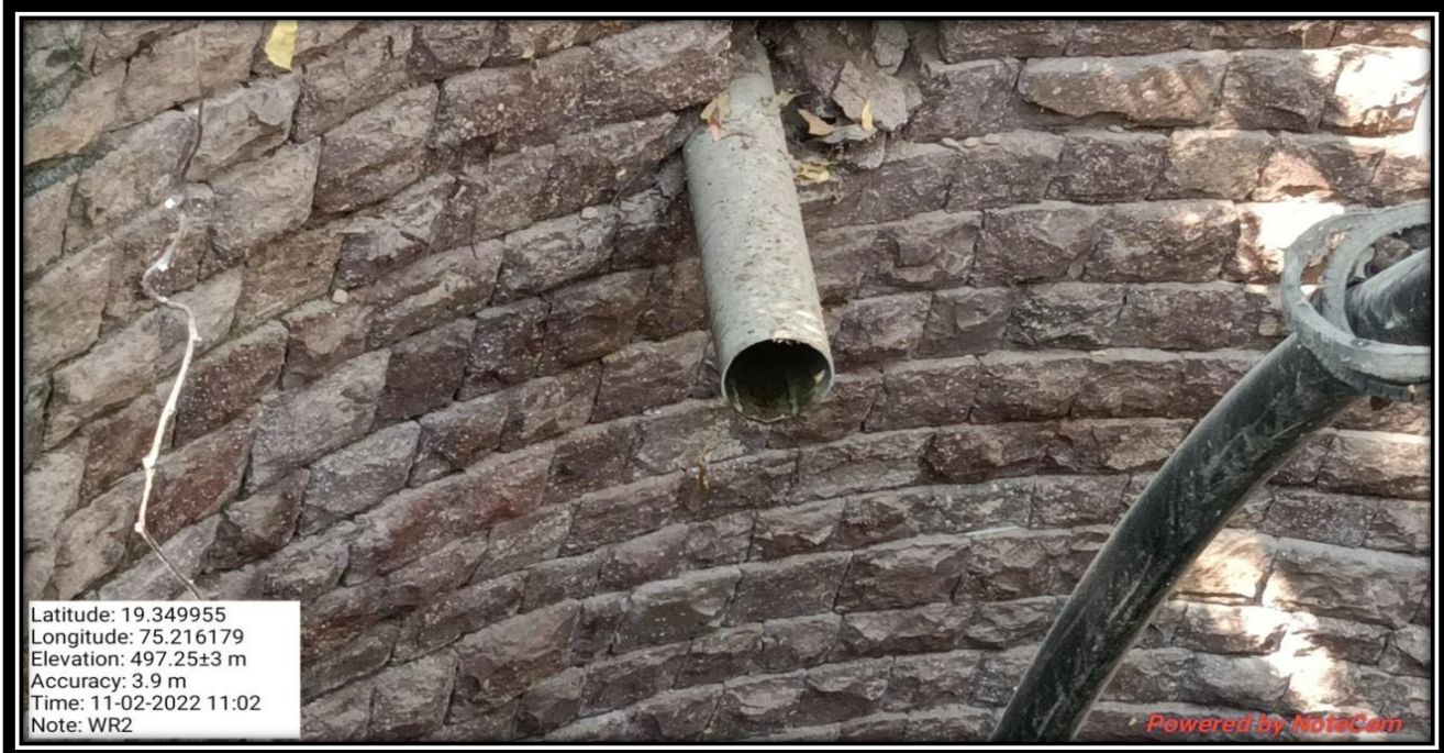
Open Well Recharge/ Refilling