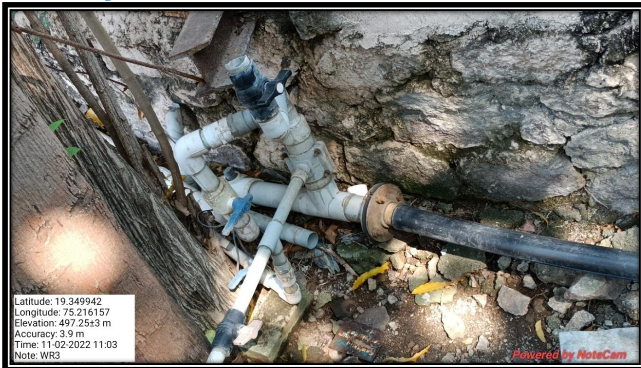
Open Well Recharge