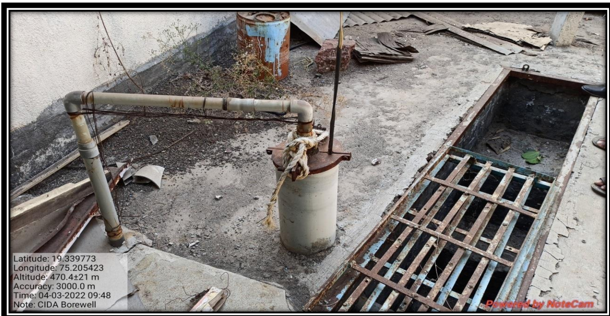
Bore-well and Tank (CIDA)