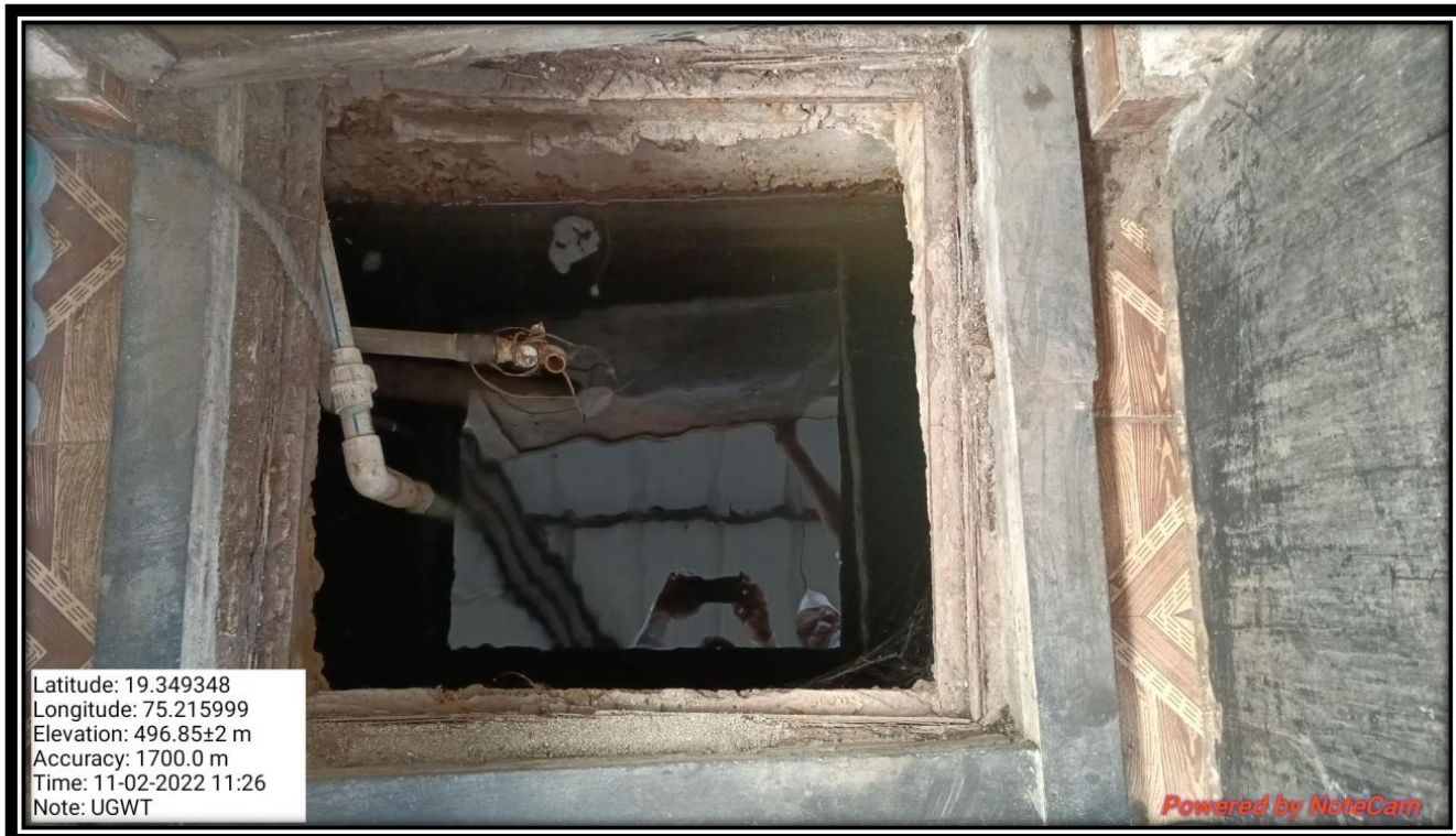
The Main Water Tank under