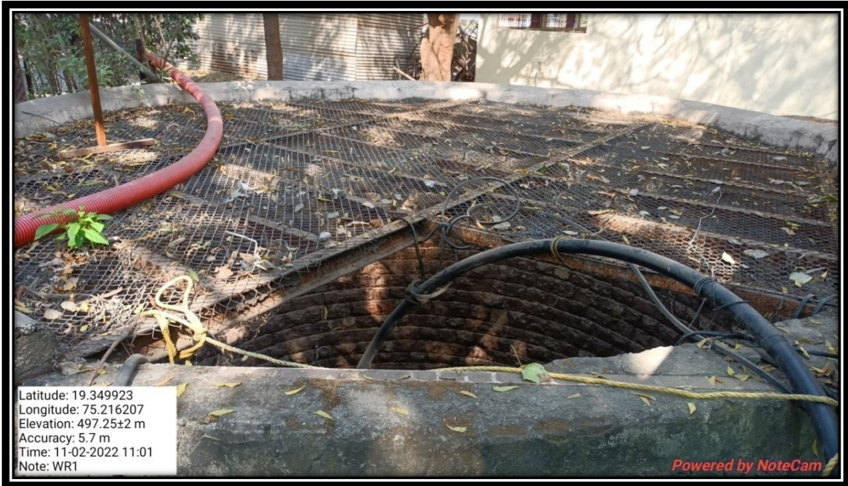
Open Well in the Campus (Maintenance of Water Bodies)