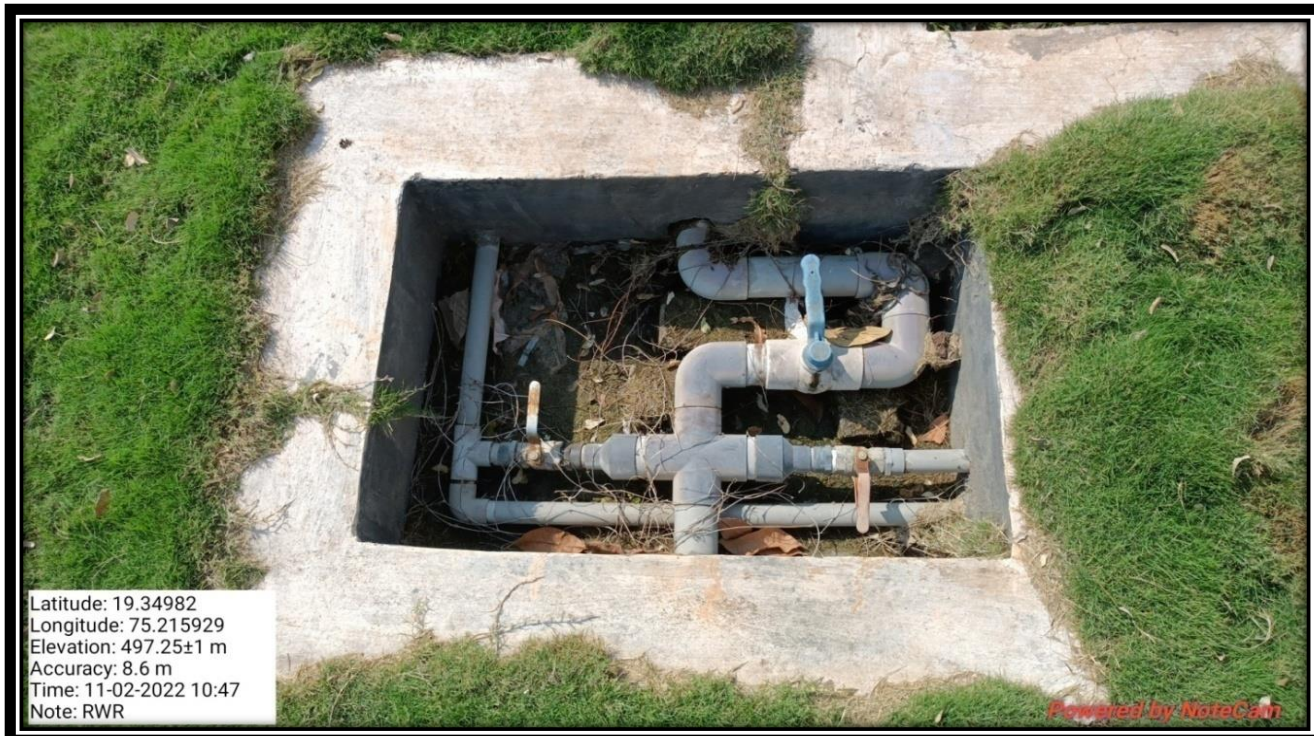
Equipment in Rain Water Harvesting: Valve system