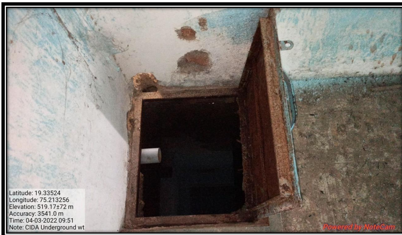
Underground Water Tank (CIDA)