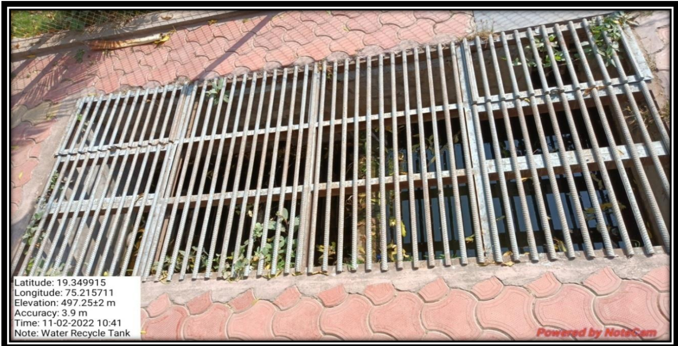
Underground Storage Tank for Rain water Collection