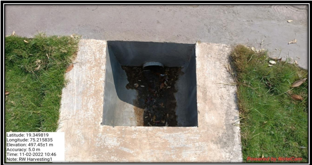
Rain water Harvesting System: Chamber