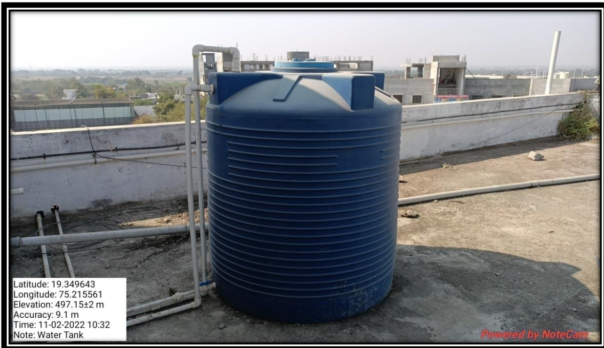
Water Tank: Water Distribution System