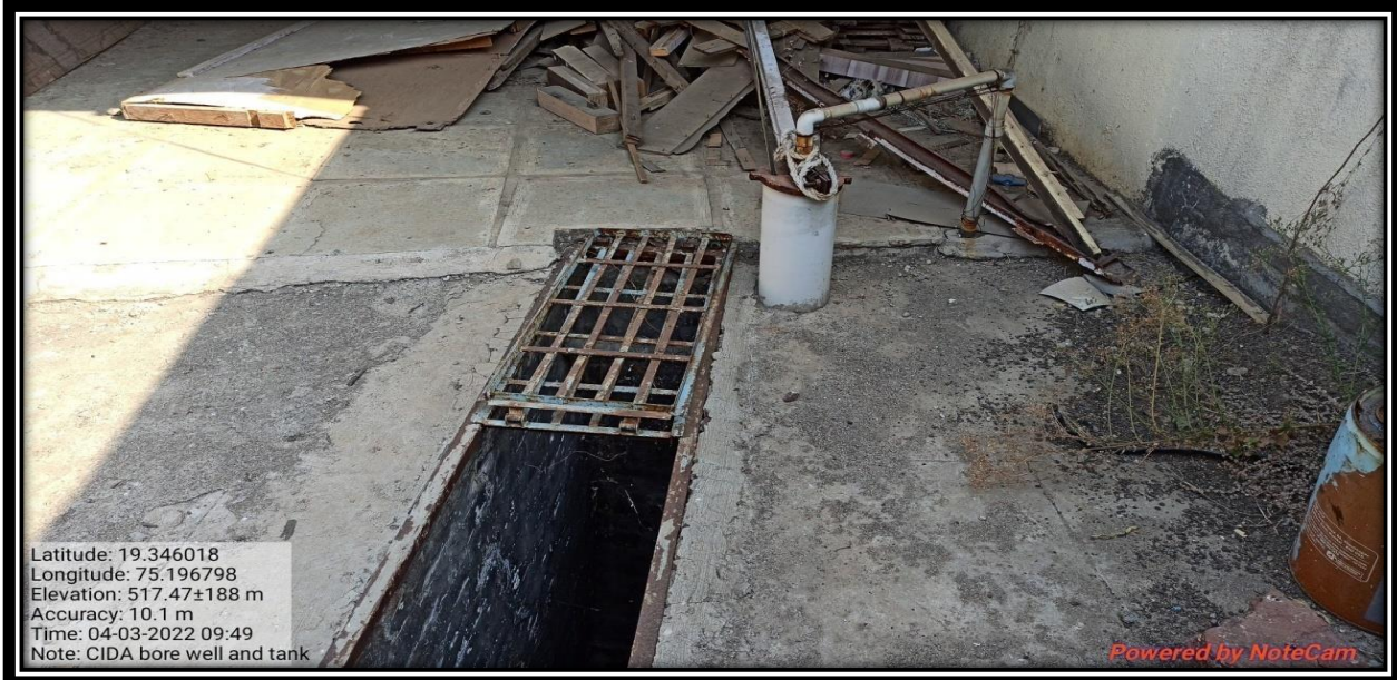
Bore-well on CIDA