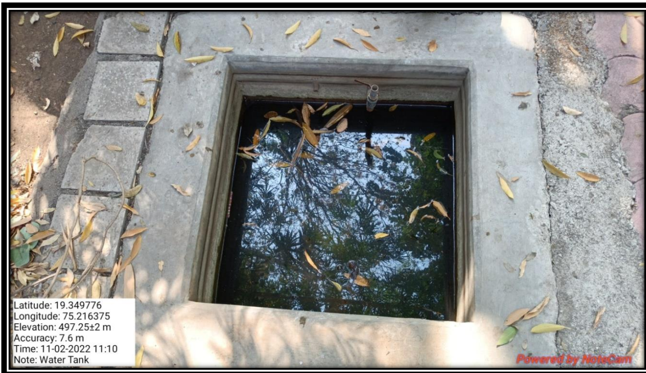
Underground Water Tank in Garden