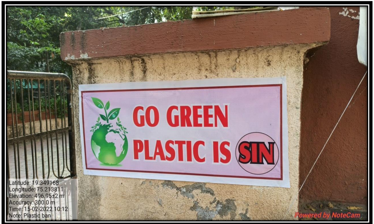
Banner Indicating Ban on Plastic Use: Gate No 2