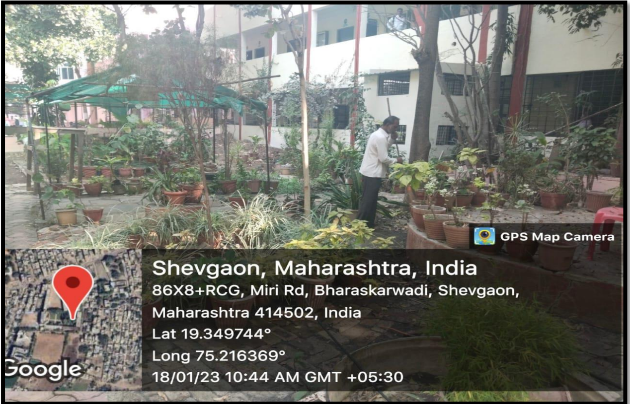
Supporting staff working in garden