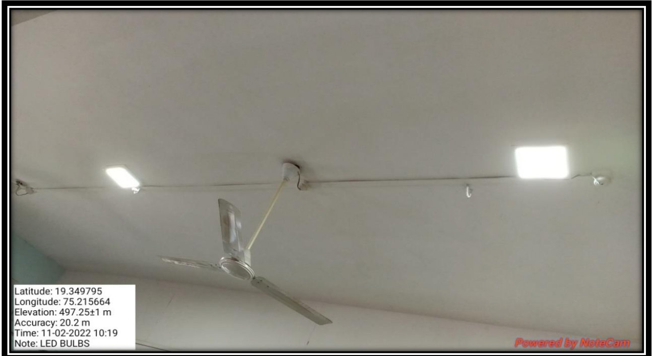
LED Bulb/ Tubes