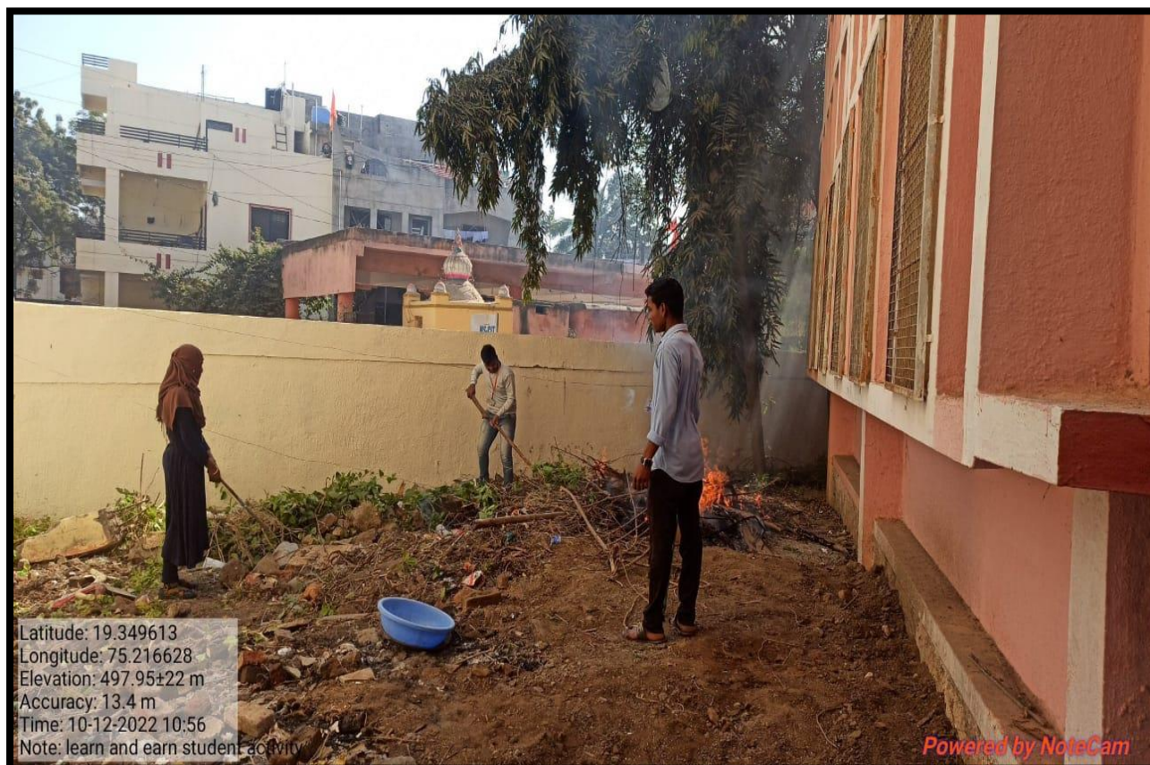
Cleanliness Drive in the Campus