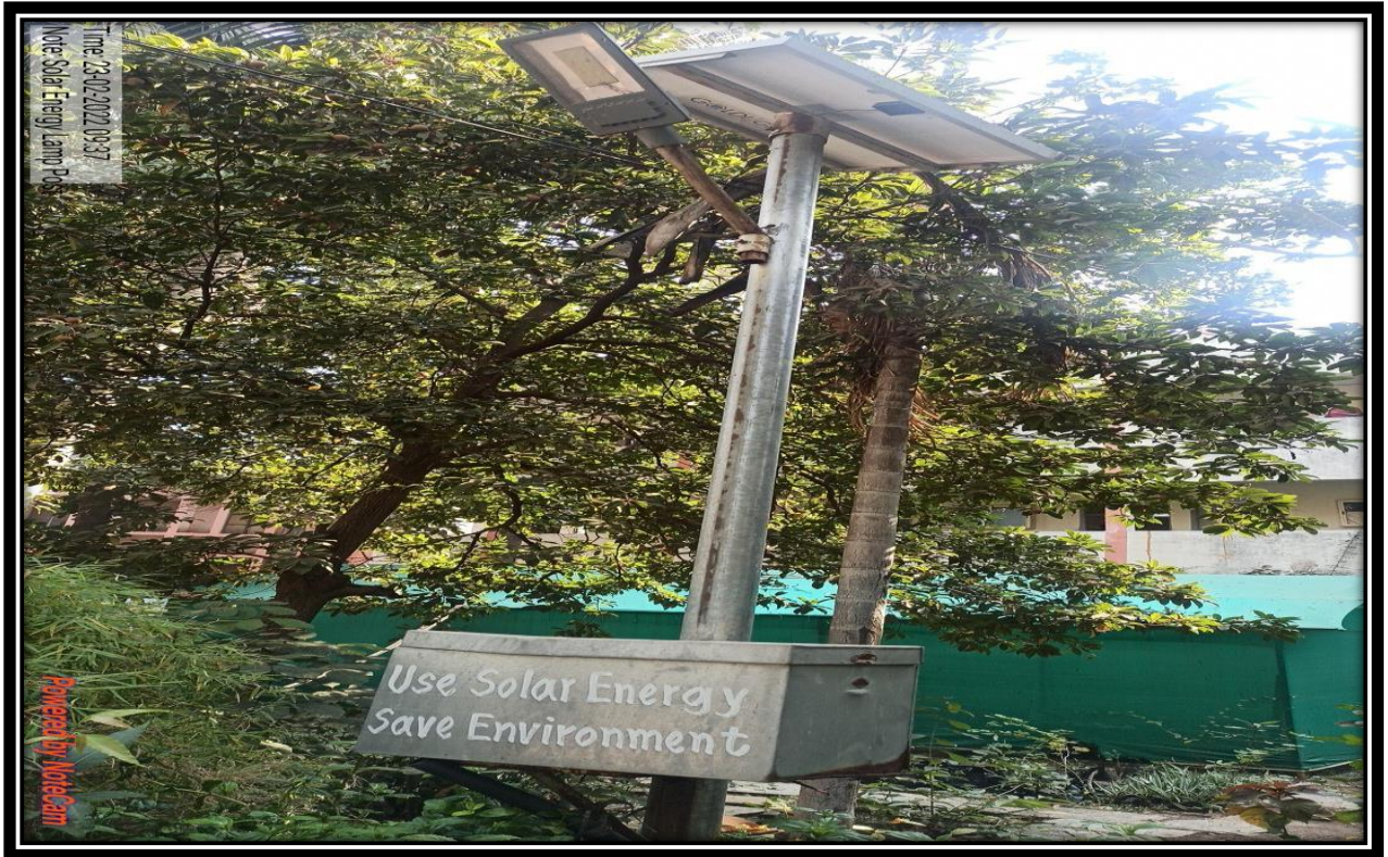
Lamp Post with Solar Equipment and Slogan