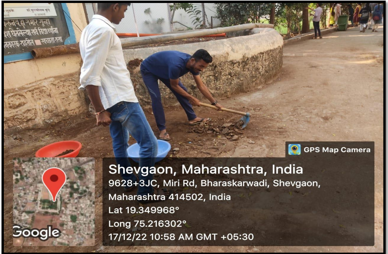
Students of Earn and Learn Scheme Cleaning the Campus