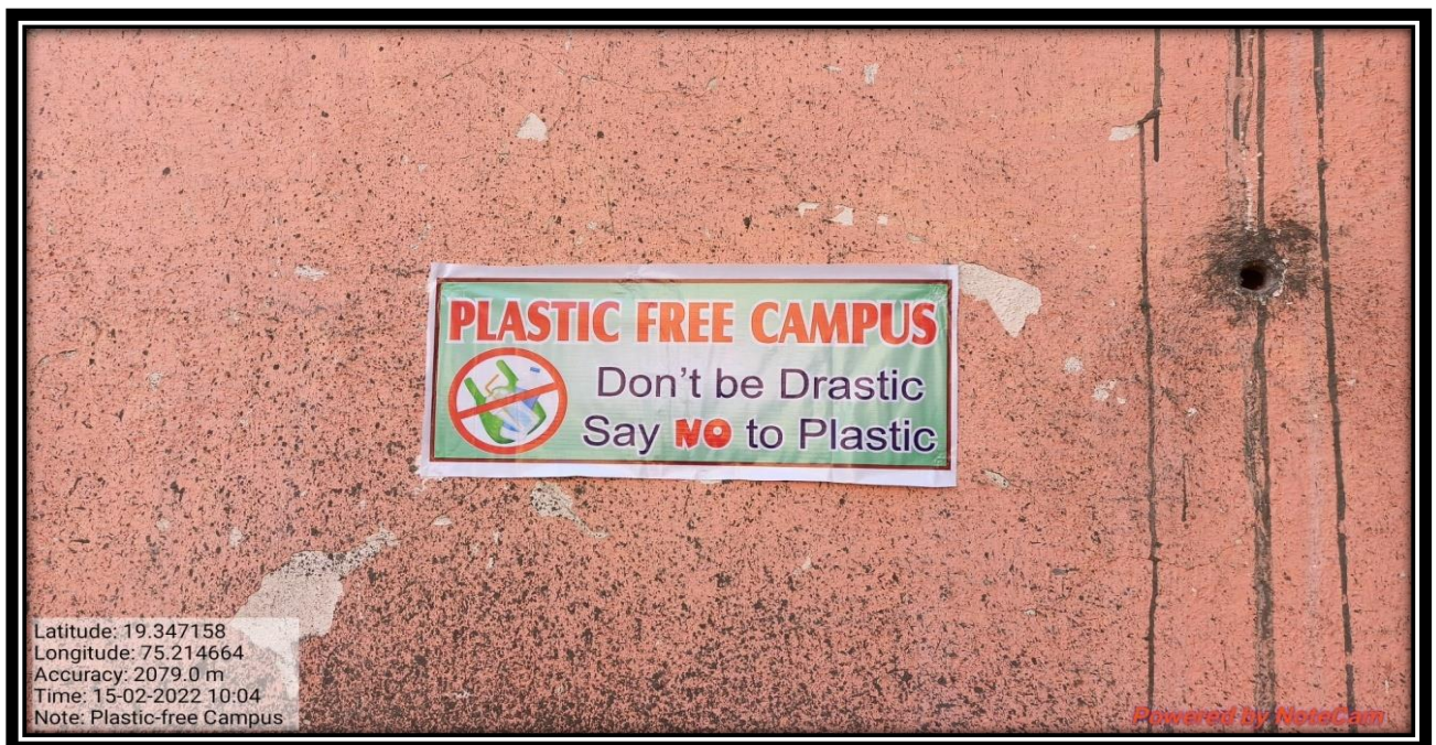
Banner Indicating Ban on Plastic Use: Library and Canteen Area