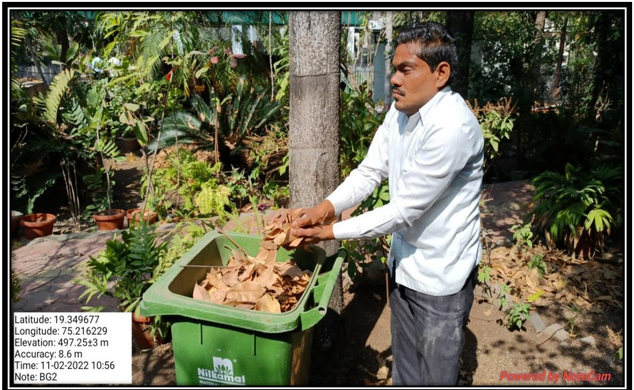
Organic waste collection