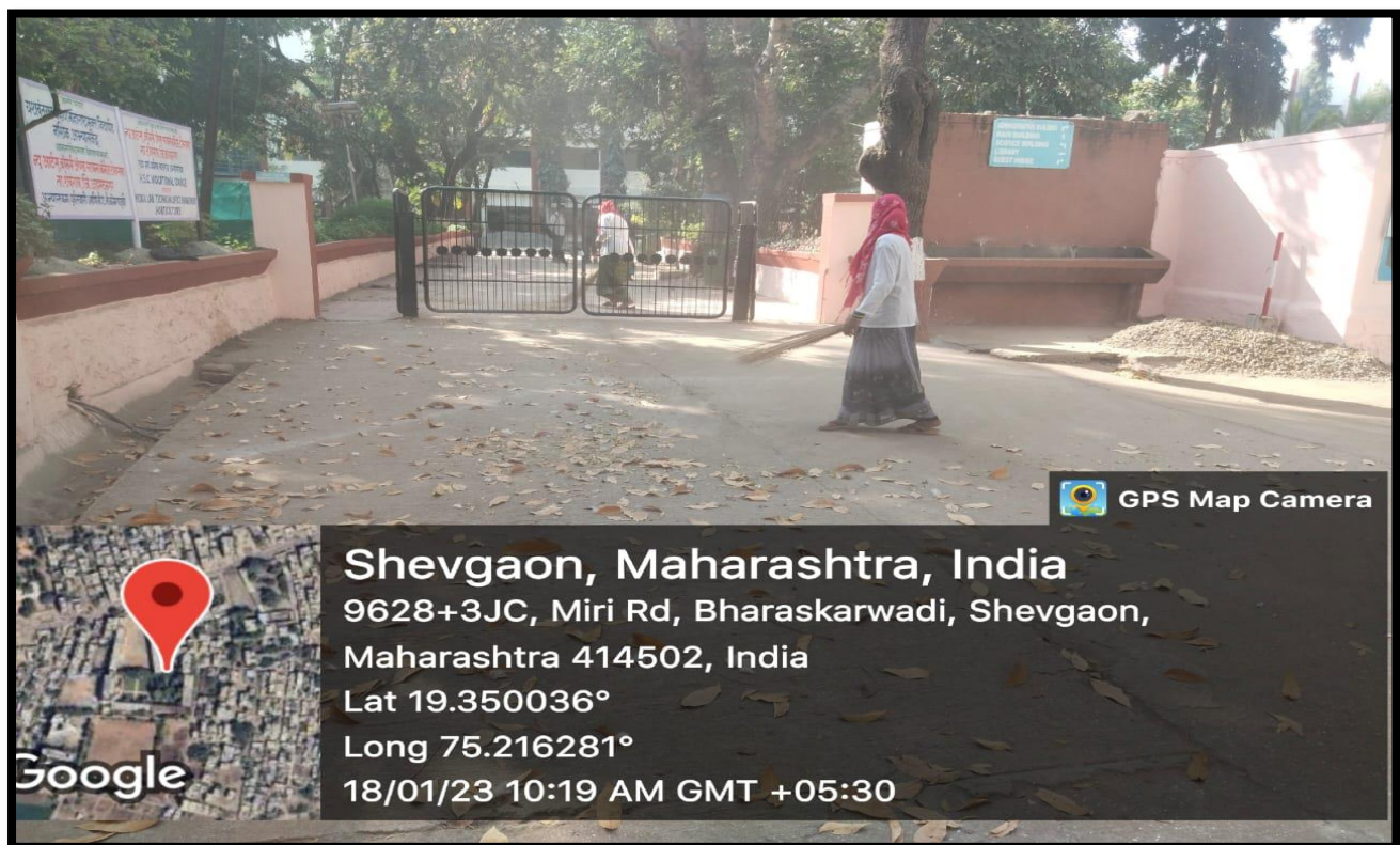
Support staff cleaning the campus